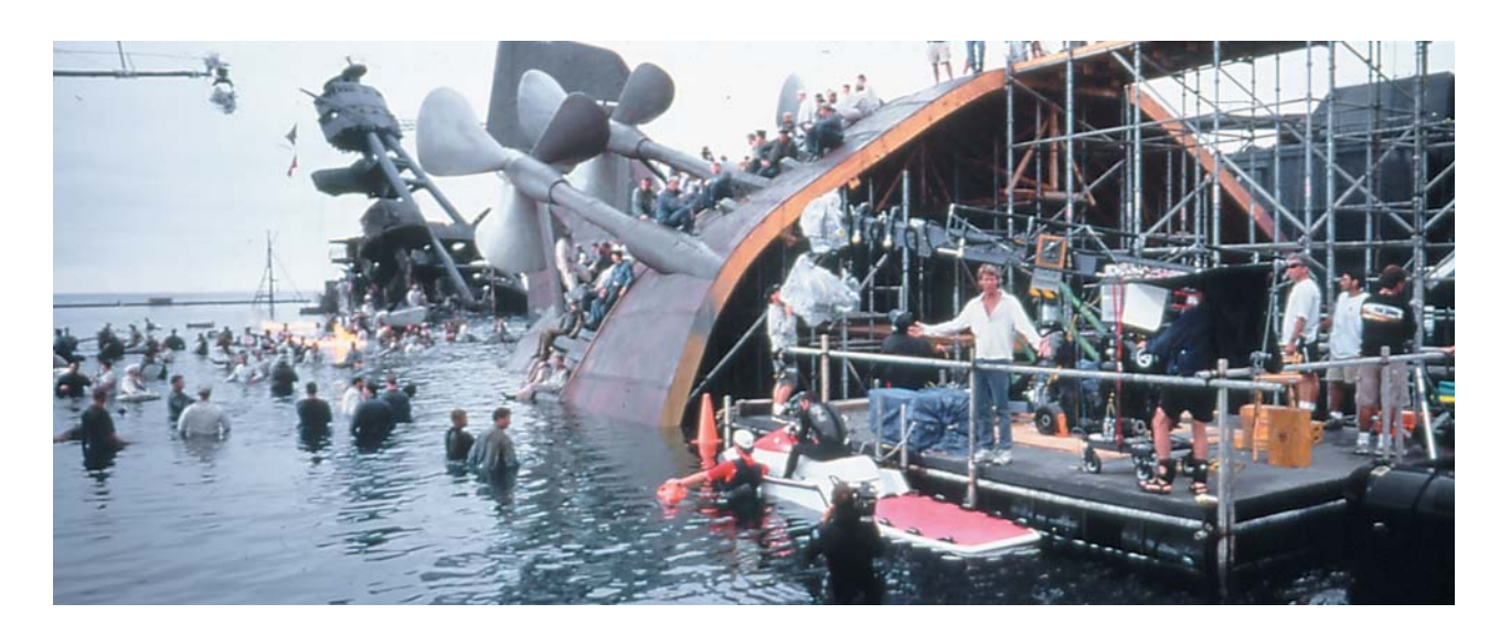
BOMBS AWAY: Michael Bay (on deck) constructed the world's largest gimbal to simulate the USS Oklahoma capsizing in Pearl Harbor (2001). It took eight weeks for crews to build the ship.