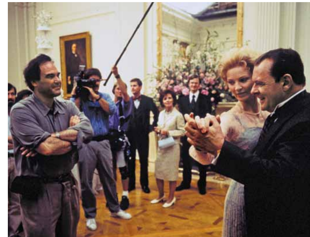
HAPPIER DAYS: Oliver Stone directs Anthony Hopkins and Joan Allen as the president and his wife Pat in Nixon (1995). Stone regarded Nixon as a "lonely, isolated [and] kind of mad" figure. He said he cast Hopkins because he was struck by the actor's isolation. "The loneliness. I felt that was the quality that always marked Nixon."