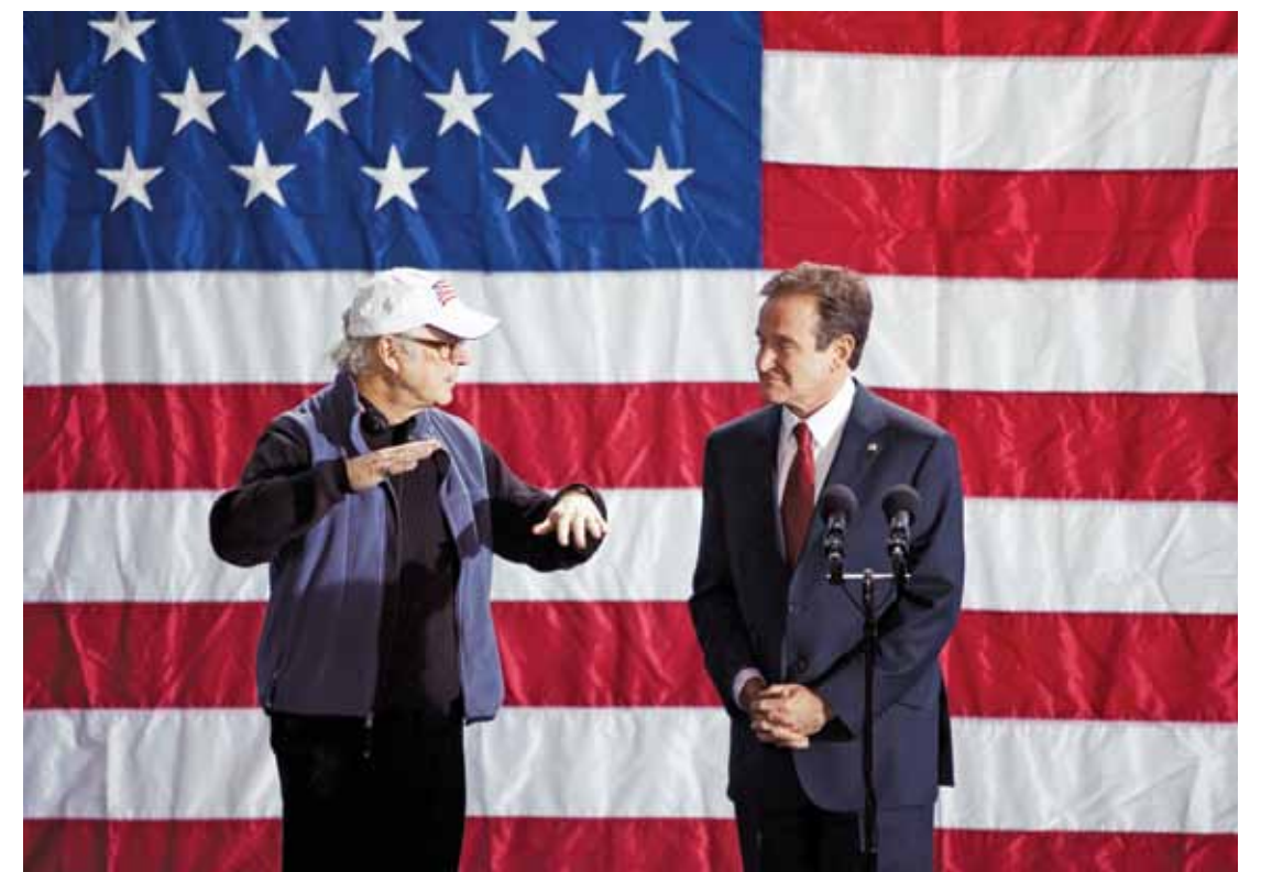
AMERICAN HERO: Robin Williams plays the host of a news satire program who runs for president and, due to a computer malfunction, gets elected in Barry Levinson's Man of the Year (2006). The film wasn't meant to be like Levinson's Wag the Dog . "It was never as dark and cynical a movie. This functioned with comedy and drama and suspense."