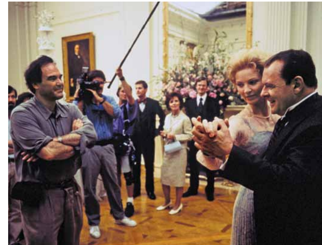
HAPPIER DAYS: Oliver Stone directs Anthony Hopkins and Joan Allen as the president and his wife Pat in Nixon (1995). Stone regarded Nixon as a "lonely, isolated [and] kind of mad" figure. He said he cast Hopkins because he was struck by the actor's isolation. "The loneliness. I felt that was the quality that always marked Nixon."