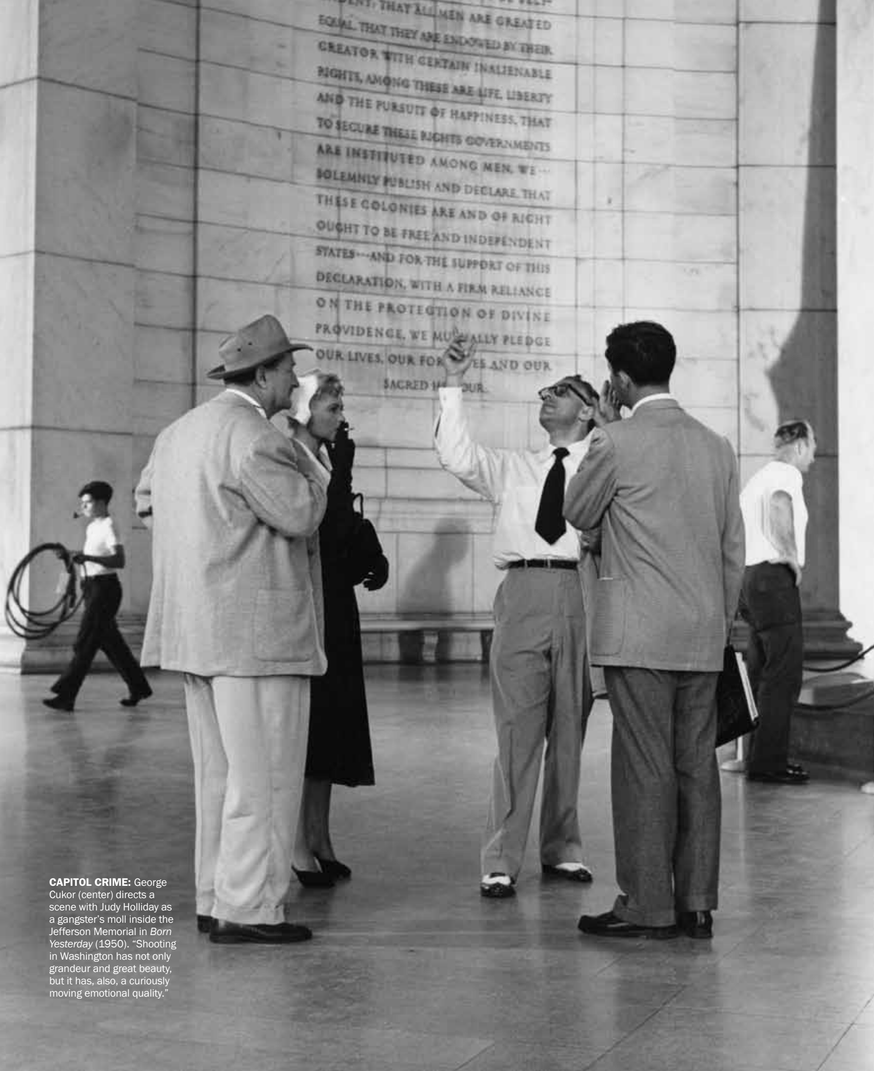
CAPITOL CRIME: George Cukor (center) directs a scene with Judy Holliday as a gangster's moll inside the Jefferson Memorial in Born Yesterday (1950). "Shooting in Washington has not only grandeur and great beauty, but it has, also, a curiously moving emotional quality."