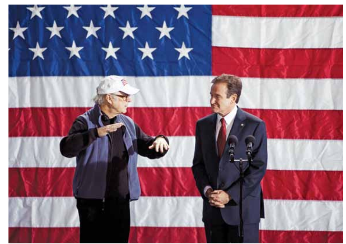
AMERICAN HERO: Robin Williams plays the host of a news satire program who runs for president and, due to a computer malfunction, gets elected in Barry Levinson's Man of the Year (2006). The film wasn't meant to be like Levinson's Wag the Dog . "It was never as dark and cynical a movie. This functioned with comedy and drama and suspense."