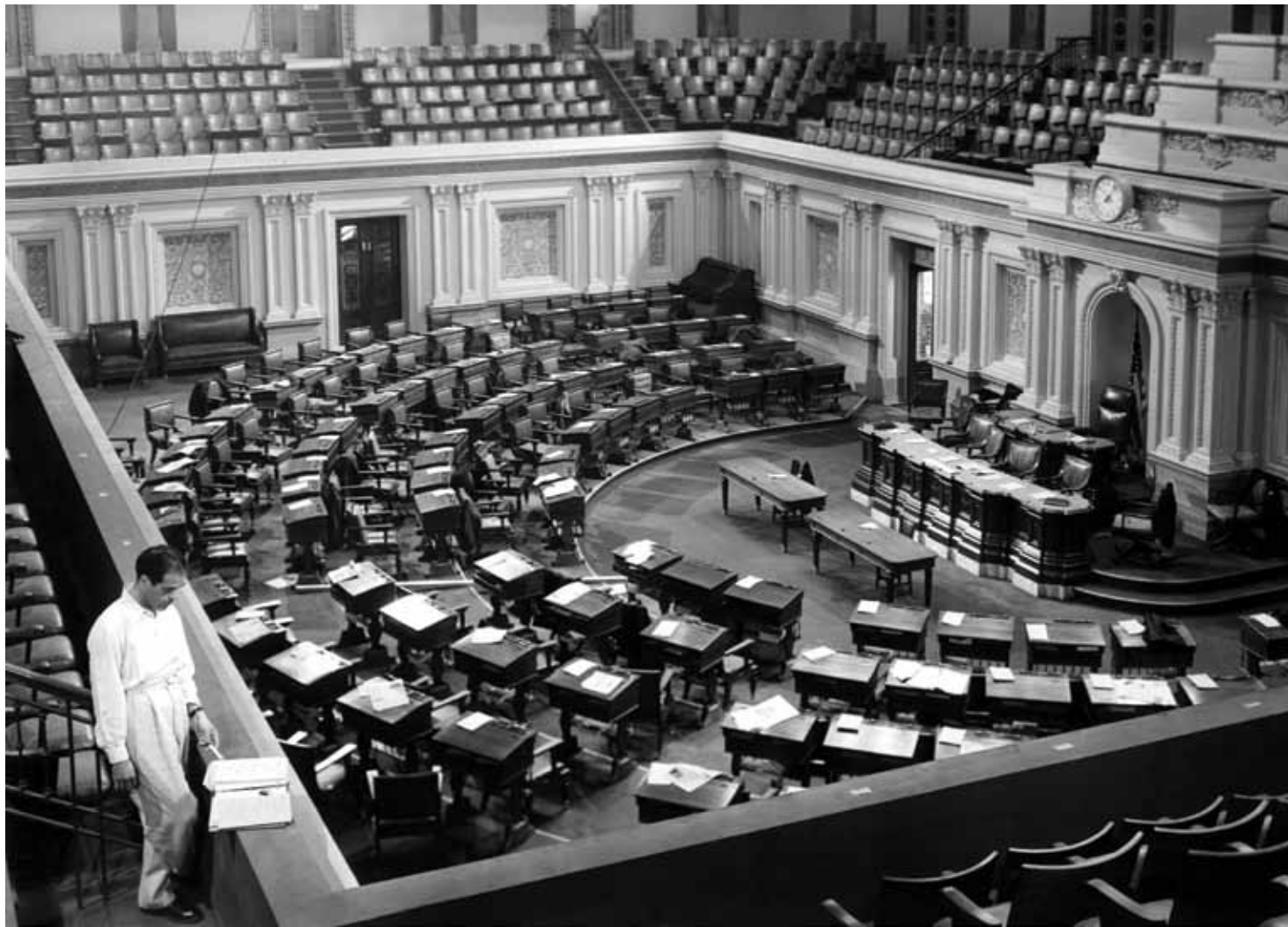
CHAMBER MUSIC: Frank Capra and his crew went to Washington, D.C., to film background material and study the layout of the Senate for his populist fable, Mr. Smith Goes to Washington (1939). The interior of the Senate was recreated full-scale, in precise detail, on the Columbia lot, along with committee rooms, cloakrooms, hotel suites and other Washington monuments.