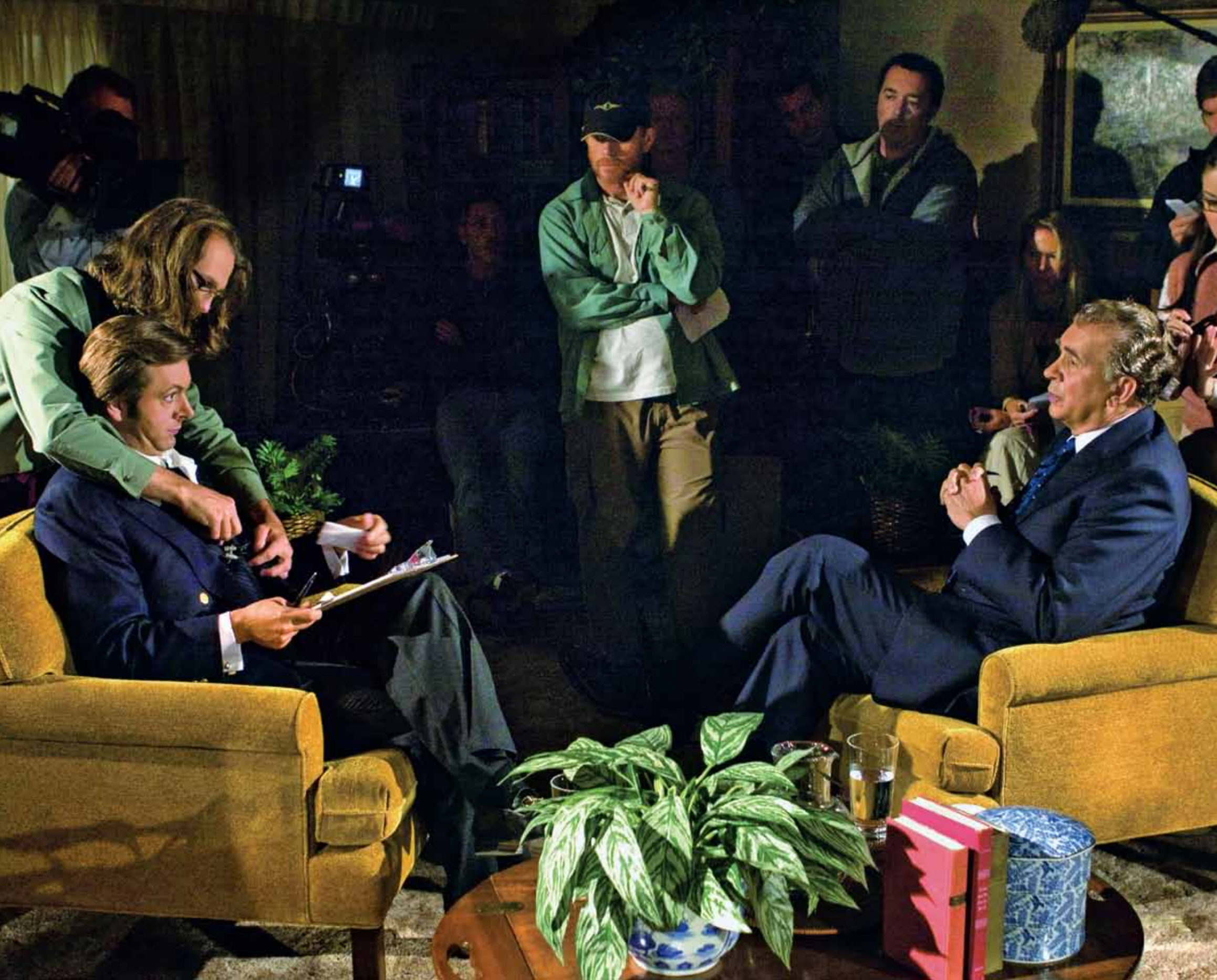
TRUE CONFESSIONS: Ron Howard agreed to direct Frost/Nixon (2008) only if the actors from Peter Morgan's Tony Award-winning stage play, Michael Sheen (left) and Frank Langella, were allowed to repeat their roles. Even off-camera, the actors remained in character and the cast and crew referred to Langella as "Mr. President."