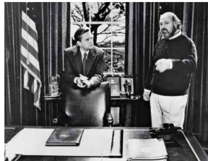
HOME ALONE: The Oval Office set for Rob Reiner's The American President (1995), starring Michael Douglas as chief executive, was originally built for Dave and later used for The West Wing . To prepare for the film, Reiner spent two days trailing President Clinton as he went through his daily routine.