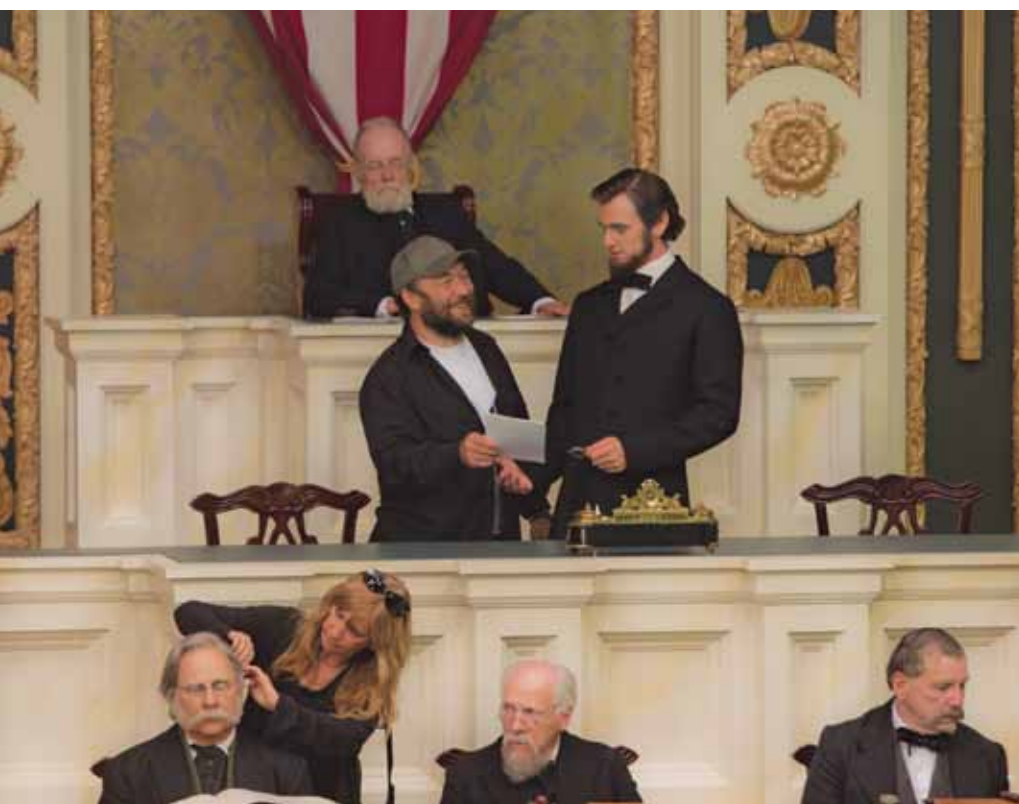
INSIDE THE BELTWAY: (right) Otto Preminger (center) shot Advise & Consent (1962) on real locations in Washington, D.C., including the Capitol and the Washington Monument. The film, about the cutthroat wheeling and dealing behind a presidential appointment, was one of several pictures Preminger made challenging the production code and Hollywood blacklist. (above) Director Timur Bekmambetov (left), well known in Russia for his vampire films, teamed with Tim Burton to produce Abraham Lincoln: Vampire Hunter (2012). Aside from his other problems, Lincoln (Benjamin Walker) is chasing vampires who are planning to take over the country.

Directors have long been fascinated with the power of the presidency and the workings of Washington. In satires, dramas, thrillers—and even a horror film—they have told America’s story.