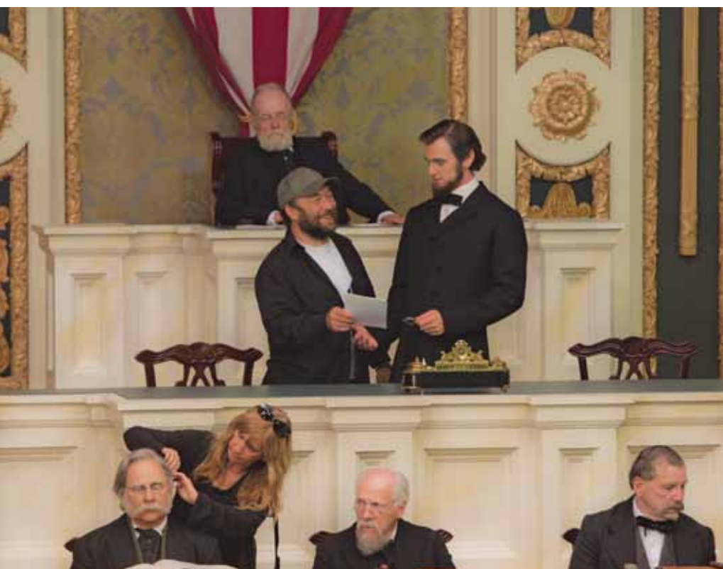
INSIDE THE BELTWAY: (right) Otto Preminger (center) shot Advise & Consent (1962) on real locations in Washington, D.C., including the Capitol and the Washington Monument. The film, about the cutthroat wheeling and dealing behind a presidential appointment, was one of several pictures Preminger made challenging the production code and Hollywood blacklist. (above) Director Timur Bekmambetov (left), well known in Russia for his vampire films, teamed with Tim Burton to produce Abraham Lincoln: Vampire Hunter (2012). Aside from his other problems, Lincoln (Benjamin Walker) is chasing vampires who are planning to take over the country.

Directors have long been fascinated with the power of the presidency and the workings of Washington. In satires, dramas, thrillers—and even a horror film—they have told America’s story.