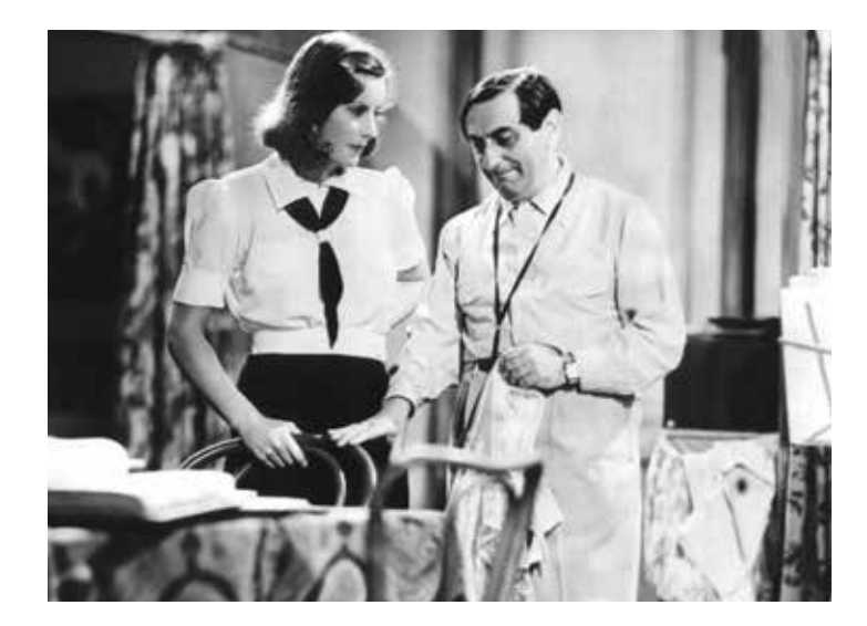
THE LUBITSCH TOUCH: As part of a deal with MGM, Ernst Lubitsch agreed to direct Ninotchka , with Greta Garbo, if the studio would allow him to make The Shop Around the Corner . The story of three Russians accommodating to capitalism in Paris, the film was built around the tagline "Garbo Laughs."