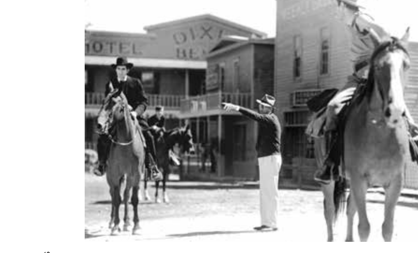
GUN CONTROL: Henry King directs Tyrone Power (left) and Henry Fonda in the Technicolor Western Jesse James . Although this scene was shot on the Fox backlot, much of the picture was filmed on location in Pineville, Mo., because it looked unchanged from the 1880s. It was the fourth highest grossing film of 1939.